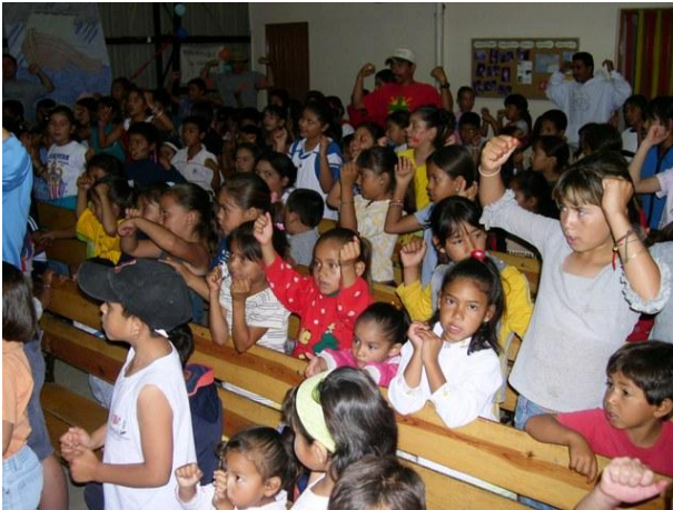
Singing a Scripture verse song in Club

As you can see from the previous page, the majority of my hours are spent in Kids Club. I love this program!